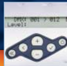
SmartPack LCD screen