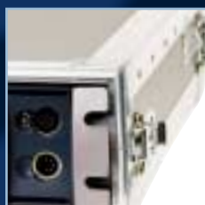
SmartPack exterior case